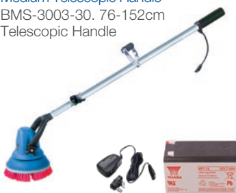
12V Battery and Battery Charger 12V 7A and BMS-BSE-1210