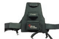
Battery & Harness Complete BMS-3011N. Battery and complete harness, with new carry handle and charger pouch.

Keep up to date via: www.motorscrubber.com.au www.oates.com.au